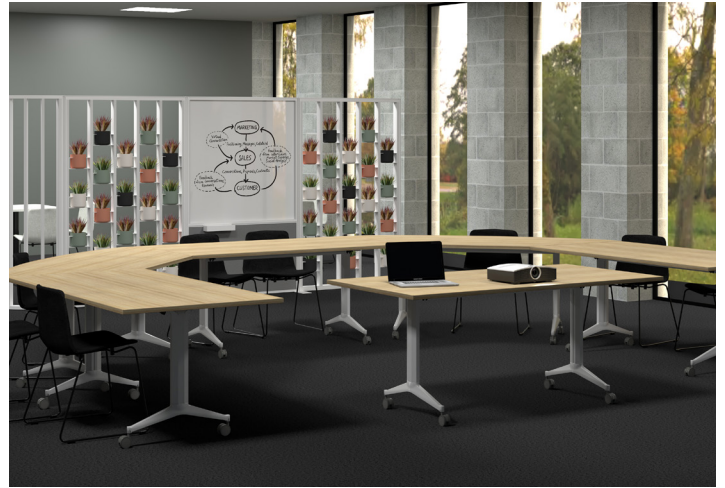
Hospitality & Conference Rooms