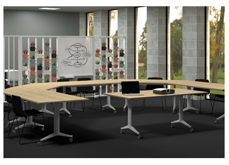
Hospitality & Conference Rooms